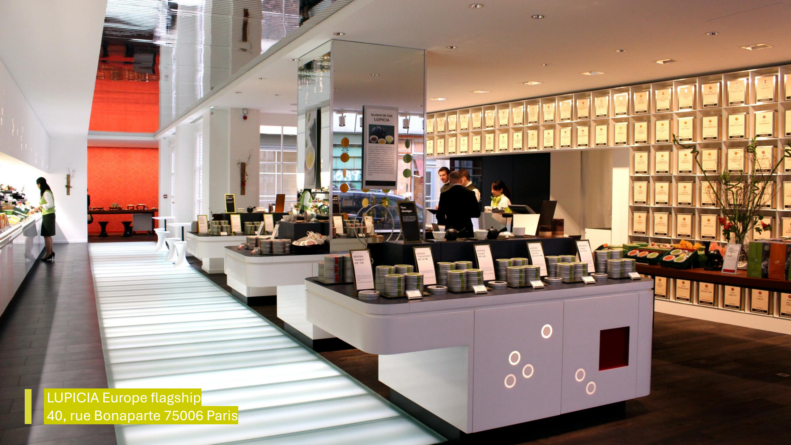
LUPICIA Europe flagship 40, rue Bonaparte 75006 Paris