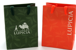
Cardboard bag 2 sizes available 2 colors (green, red)