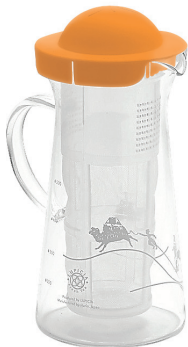
S size 600ml Réf. HC052