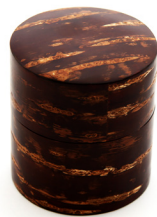
AKITA tea caddy 50g | Ref. 37243