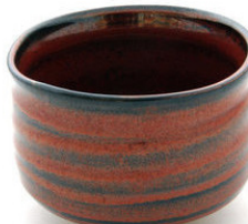
Matcha bowl TETSUAKA D : 11.5 cm | Ref. MIJ11