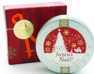
1 TIN GIFTSET