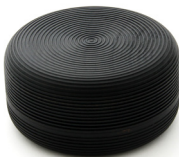
SO tea caddy 50g | Ref. 43001