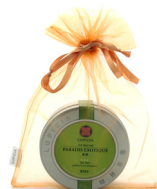
Bourses en organza 3 colors (white, sand, pink)