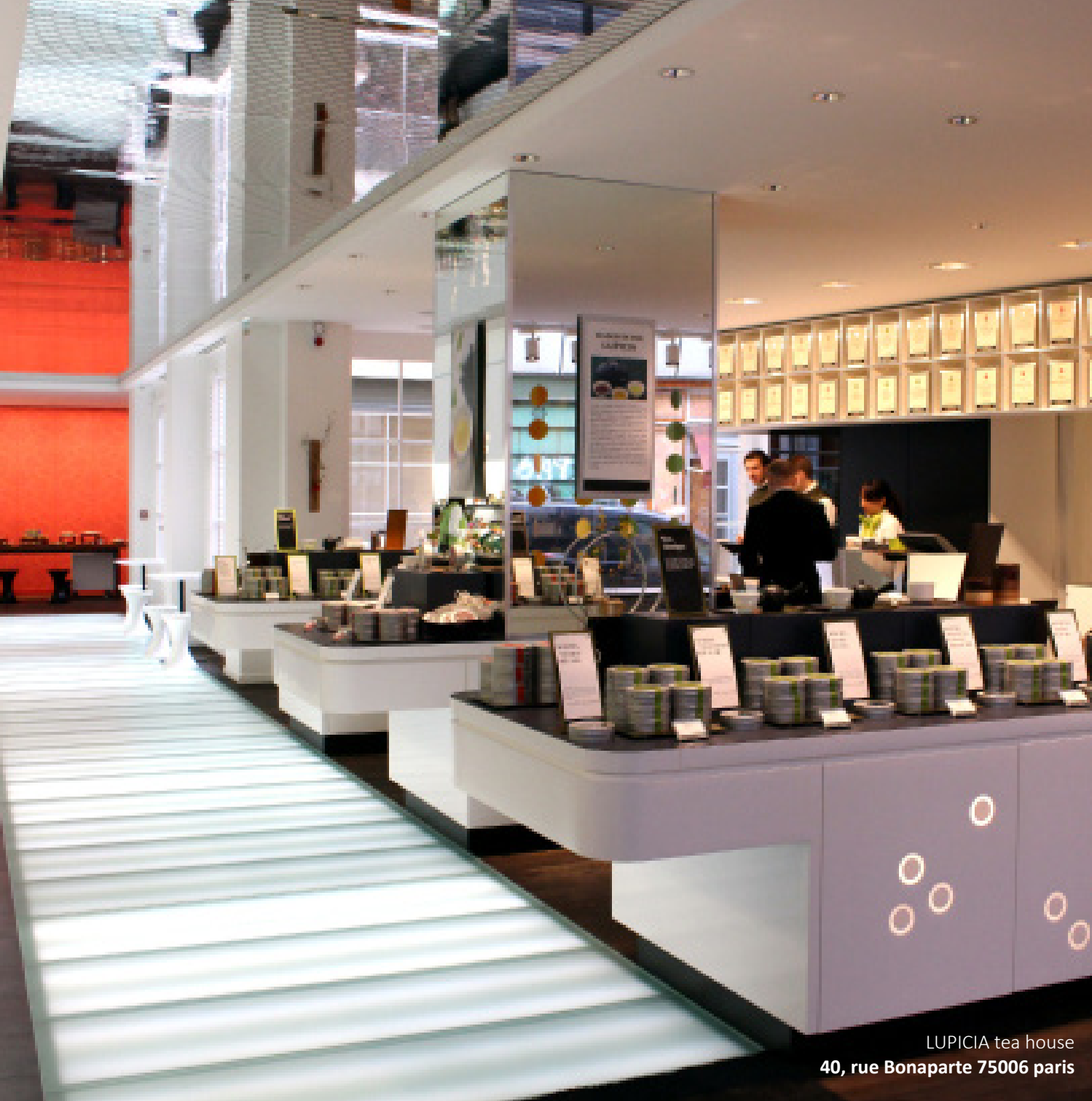
LUPICIA tea house 40, rue Bonaparte 75006 paris