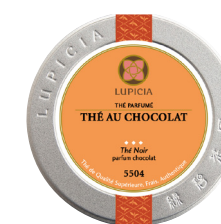
Flavored black teas