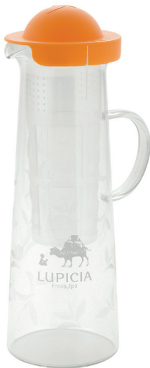
L size 1000ml Réf. HC051

Carafe with built-in filter for infusing hot or iced teas. Designed for easy entry in the door of your fridge, its slender design and transparent as well as its low weight make it a pleasant decanter to use.