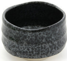
Matcha bowl YUTEKI TENMOKU D : 11.5 cm | Ref. MIJ13

Find all our accessories for Matcha on www.lupicia.fr