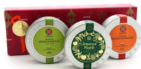
3 TINS GIFTSET

The labels can be used with the tea of your choice or one of our 3 Christmas teas SNOW WHITE, JINGLE BELLS or CHRISTMAS SONG