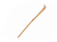
Bamboo spatulas 12 cm or 18 cm