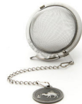
LUPICIA tea infuser Ref. AC033

Premium cultivated green tea with the greatest care away from light + 1 tea box + 1 teaspoon. Ref. 0124