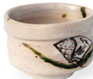
Matcha bowl YASHICHIDA D : 9.5 cm | Ref. JPT30