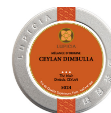
Plain black teas