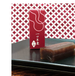
Yôkan OGURA Ref. YOK4