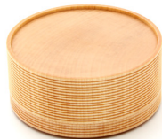
JU tea caddy 50g | Ref. 40000