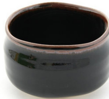
Matcha bowl TENMOKU D : 11.5 cm | Ref. MIJ12