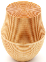
KAMA tea caddy 100g | Ref. 41000