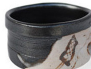
Matcha bowl KURO D : 9.5 cm | Ref. JPT31