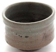
Matcha bowl KARATSU D : 9.5 cm | Ref. JPT29