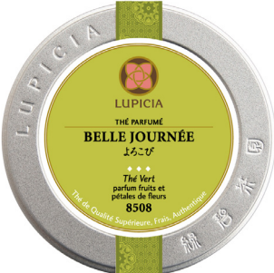
50g metal tin

Hermetic, it contains a loose bag and can be reused to preserve tea.