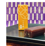
Yôkan CHESTNUT Ref. YOK3