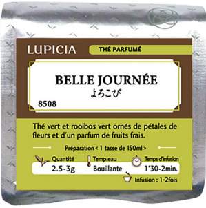
50g tea loose pack

LUPICIA is the only house to offer a 6-step tea leaf sorting process. Automated and specially made to measure, this system eliminates any foreign body within the leaves.