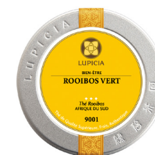
Rooibos & herbal