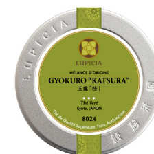
Green teas & plain oolong teas