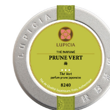
Green teas & flavored oolong teas