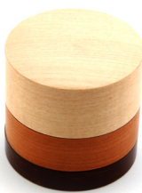
KAEDE tea caddy 50g | Ref. 37241