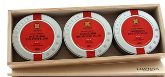
Wooden gift set 2 sizes available