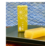
Yôkan YUZU Ref. YOK2

This stainless steel tea ball will allow you to realize your brew easily.