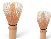
Bamboo whisks 9 cm or 11,5 cm