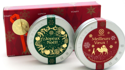
2 TINS GIFTSET